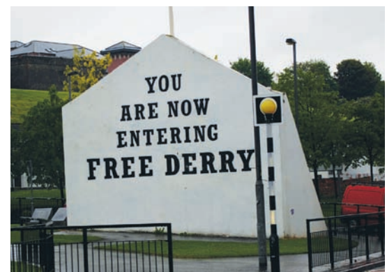
During "The Troubles," barricades were erected in the Bogside of Derry to exclude government forces oppressing the Catholics, including this famous wall bearing the "Free Derry" slogan.

Some of my research has been conducted in Northern Ireland, specifically the Derry/Londonderry area, which was one of the central geographic locations of the Sectarian Conflict/"The Troubles" including the infamous "Bloody Sunday" Massacre. Violence (including random bombings, shootings, captivity, etc.), segregation, and discrimination were extremely common from the late 1960s through the 1994 Peace Treaty (The "Good Friday Agreement"). Over the last few years of traveling to Northern Ireland, I had the opportunity to speak with many individuals living there, and it became apparent that every individual, whether on the "front lines" of the violence or not, was affected. Even if not participating directly in the violence, it was common for people to have to do things like think about which route to take to avoid a check point, or which channel to put on