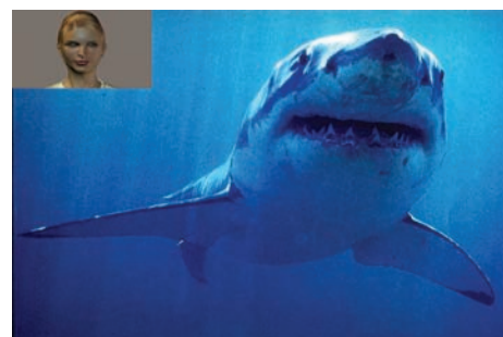
Mismatching example: Happy face on fear image.

Delineating the nature of disturbances in the processing of emotional information is expected to improve our understanding of the etiology, nature, and maintenance of PTSD. Improving our understanding of these issues will enable us to develop better psychotherapeutic interventions to help individuals with PTSD.