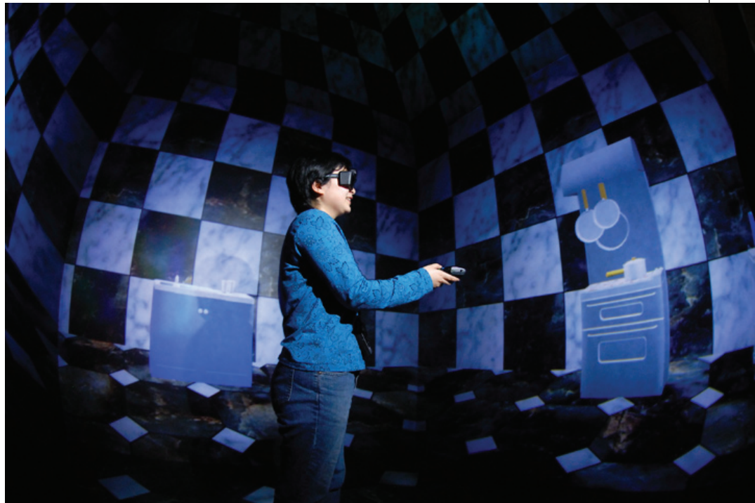
People moving in a virtual reality kitchen automatically keep track of the virtual objects as if they were real.

One explanation of this phenomenon is that real and imagined environments have different behavioral consequences. An imagined stove cannot collide with you, but a real closet can if you overstep by accident. Thus, while it is not necessary for successful locomotion