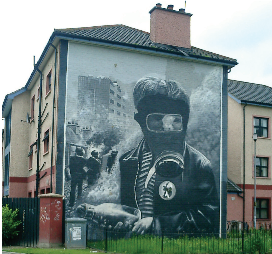
The Bogside Artists report that the mural, "Petrol Bomber," has had the most appeal to outside viewers as it "puts a face on the struggle for civil rights and gives voice to the resolve of the oppressed people everywhere."

Experiencing a traumatic event is much more common than most people think. In fact, up to 60 percent of the population in the United States has been exposed to at least one traumatic event within their lifetime, including traffic accidents, physical or sexual assault, natural disasters, having someone close die suddenly, or military/war exposure. Most people who experience a traumatic event experience some initial reactions (e.g., feeling numb, having trouble sleeping, avoiding talking about the event, etc.), but these problems usually go away within a few weeks. However, some individuals (approximately 8 percent in the United States), develop Posttraumatic Stress Disorder (PTSD).