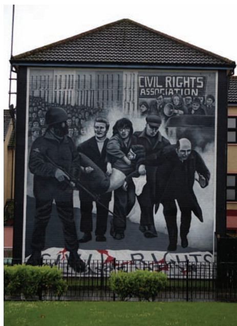
Murals depicting significant historical events from "The Troubles" can be found throughout the Bogside of Derry. The murals were created by three men known as the Bogside Artists.

Consequently, since every person has been exposed to traumatic and stressful events just by living through "The Troubles," it is not a far stretch to believe that every person could be at risk for developing some side effects of exposure, including changes in the way he or she experiences emotions as well as perceives/recognizes emotions in other people. Often there are stigmas attached