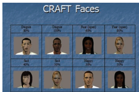
Faces selected from stimuli set created in our lab after extensive testing.

Since facial expressions arguably play one of the most critical roles in non-verbal communication and emotional processing, we examined accuracy and reaction time of