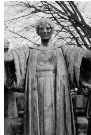
Alma Mater at the University of Illinois at Urbana-Champaign

Our program is committed to excellence in scientific clinical training and to using clinical science as the foundation for designing, implementing, and evaluating assessment and intervention procedures. Our educational philosophy emphasizes a creative, scholarly, and socially responsible approach to clinical and community psychology. Our mission is to produce graduates who assume leadership roles and contribute to the discipline and to society.